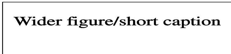
Figure 3. Figure with short caption (caption centred).

6.6.1. Examples. The following examples show how to format a number of different figure/caption combinations. Note that the table borders are shown as broken lines for guidance only.